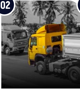
Export & Import activities