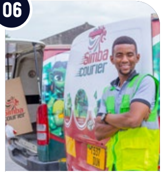
B2B & B2C Distribution and reverse Logistics